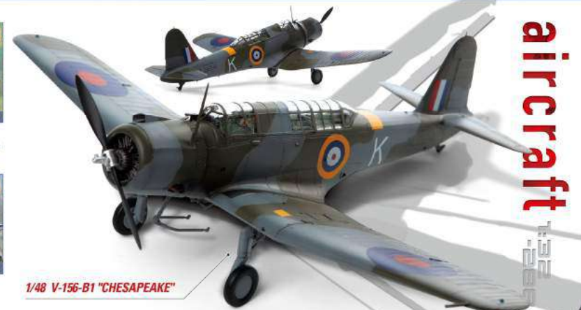
1/48 V-156-B1 "CHESAPEAKE"