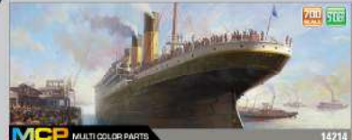
R.M.S. TITANIC "CENTENARY ANNIVERSARY" 14214