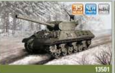
M4A3(76)W "BATTLE OF THE BULGE" WWII US Army main battle tank. Newly tooling parts, engine deck, late version VWS and accessories. Accurately reproduced 76mm main gun and M2 12.7mm machine gun. Includes full Dorrable track. Photo-etched parts. Includes color vinyl film options.