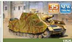
GERMAN STURMPANZER IV BRUMMBÄR The heavy assault gun built on Panzer IV chassis with 15cm main gun was used by WWII German army for infantry support.