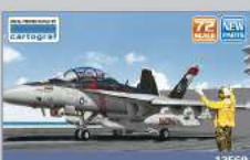
USN E/A-18G VAQ-141 "SHADOWHAWKS" USN carrier-based, electronic warfare aircraft, a specialized version of the F/A-18. AN/ALQ-99 and AN/ALQ-99 electronic warfare systems, AN-119 air-to-air missile and drop tanks included.