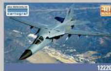
ROYAL AUSTRALIAN AIR FORCE F-111C The first of the F-111 series, this jet was designed as a carrier-based plane with the ability to be refilled for other operations.