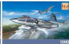
F-104G Designed for rapid climb and high altitude combat, the F-104G power earned it the nickname "Missile with a Man in It".