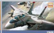
F-14 The U.S. Navy's premier carrier-based fighter, the F-14A, is capable of Mach 2 flight and low-speed engagements thanks to its variable geometry wings.