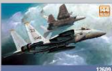
F-15C Designed specifically to be a superior fighter jet, this plane carries an astounding array of air-to-air and air-to-surface weapons.