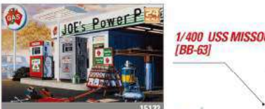
JOE'S POWER PLUS SERVICE STATION 15122