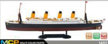
R.M.S. TITANIC 14217