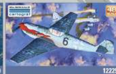
MESSERSCHMITT Bf109T-2 Reproduction of by extended main wings of the type Bf109T-2. Wing tip area included.