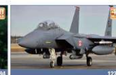
USAF F-15E "SEYMOUR JOHNSON" Fully engraved panel lines & rivet details. Highly detailed cockpit interior & landing gear. Sniper XR, AIM-120, AIM-9, BBQ-31, GBU-12, etc. variety armament & accessories included.