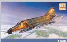
F-4E Considered as the leading all-round combat aircraft of the 1960s, the Phantom is capable of Mach 2-plus speeds.