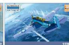
TBM-3 "USS BUNKER HILL" Fully engraved panel lines & rivet details. Detailed cockpit & landing gear. Authentic markings included.