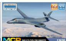
USAF B-1B 34TH BS "THUNDERBIRDS" U.S. Air Force's supersonic variable-sweep wing strategic bomber with improved electronics, airframe and low-altitude performance.