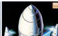
SPACE SHUTTLE W/BOOSTER ROCKET The Space Shuttle flew numerous missions over two decades from 1981, deploying satellites and acting as a laboratory.