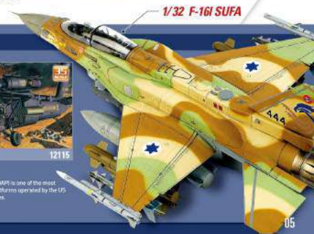
1/32 F-16I SUFA