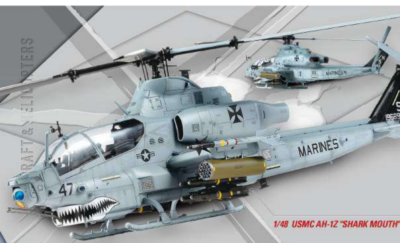
1/48 USMC AH-1Z "SHARK MOUTH"