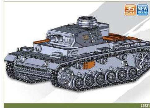
GERMAN PANZER III WW2 German medium tank's later variant with additional armor and upgraded gun developed for anti-tank role