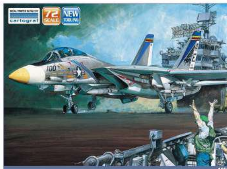
USN F-14A VF-143 "PUKIN DOGS" Supersonic, twin-engine, variable-sweep wing fighter used by the U.S. Navy as an air superiority fighter, fleet defense interceptor and on tactical aerial reconnaissance missions.