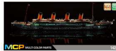
R.M.S. TITANIC 4-LED SET 14220