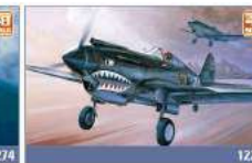
P-40C Before the U.S. entered World War II, many American pilots flew these planes in support of the Allied war effort. Collectively they were known as the "Flying Tigers" for their unique paint schemes.