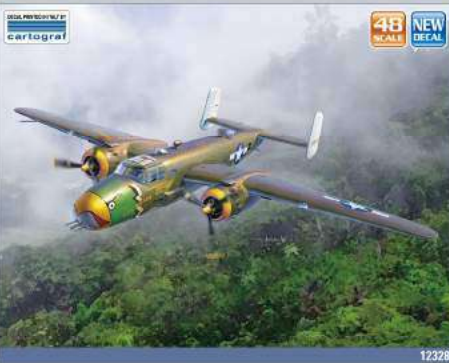
USAAF B-25D "PACIFIC THEATRE" American two-engine, medium bomber manufactured by North American Aviation (NAA).