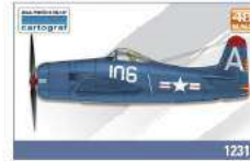
FBF-1/2 "USS TARAWA" Accurately detailed panel lines and rivets. Precisely engraved cockpit & landing gear. Can be built as FBF-1 or FBF-2.