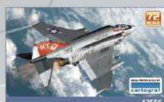
USMC F-4J "VMFA-232 RED DEVILS" USMC twin-engine, multirole, standard jet aircraft. Drop tanks, air-to-air missiles, bombs included. Precisely engraved cockpit & landing gear. Automatically detailed panel lines & rivets.