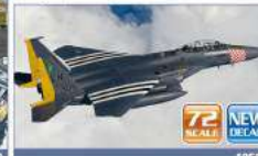
USAF F-15E "48TH FIGHTER WING" Modern U.S. Air Force twin-engine, tandem seat, multirole jet fighter.