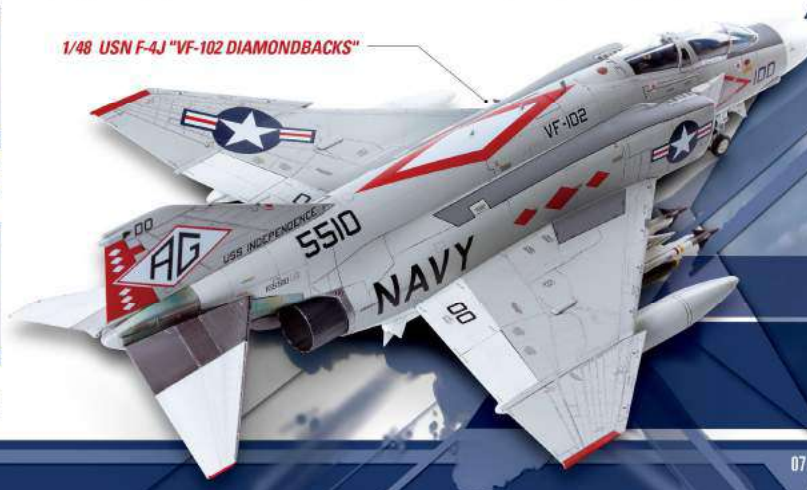
1/48 USN F-4J "VF-102 DIAMONDBACKS"