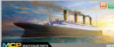
THE WHITE STAR LINER TITANIC 14215