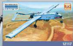
U.S. ARMY RQ-7B UAV Two figures & display stand included. It carries a uniform of figure with a school.