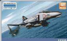
USMC F-4B/N VMFA-531 "GRAY GHOSTS" Precisely engraved cockpit & landing gear. Accurately detailed panel lines & rivets. Various air-to-air and air-to-air weapons included.