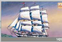
NEW BEDFORD WHALER 14204