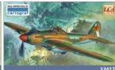
IL-2 SHTURMOVIK Fully engraved panel lines. Highly detailed cockpit & landing gear. Canopy can be positioned open & closed airbrake.