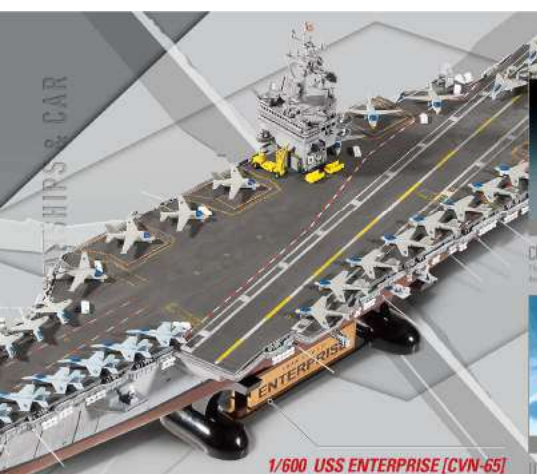
1/600 USS ENTERPRISE (CVN-65)