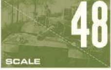
USSR M10 "LEND-LEASE" American M10 tank destroyer produced for USSR under the Lend Lease program. The 3-inch main gun. 30-caliber machine gun accurately reproduced. Accurately reproduced crew compartments. Features like photo-etched legs. Photo-etched parts included.