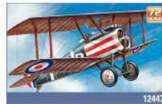
SOPWITH CAMEL WWI FIGHTER The most successful British fighter plane of World War I, the dogfighter was renowned for shooting down German ace Baron Manfred von Richthofen, "The Red Baron".