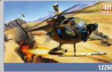
500D TOW HELICOPTER First flown in 1976, engine modifications gave this helicopter its nickname: "The Goose One." The 500D was equipped with a tow missile system.