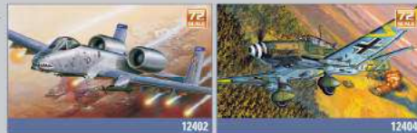
A-10A "OPERATION IRAQI FREEDOM" This A-10A was used for ground attacks as well as operations during the Iraq War.