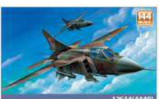
M-23 FLOGGER A variable geometry air-combat fighter used as a primary air-to-air tactical aircraft in the Soviet Air Force.