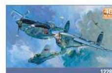
P-38 COMBINATION VERSION Optional markings and parts for different variations of Fighter Bomber: Pathfinder, Drop Snout or Photo Recon.