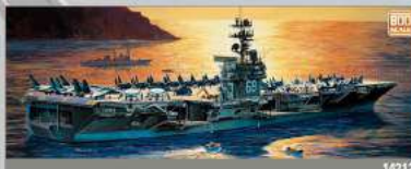
U.S.S. CVN-69 EISENHOWER 14212