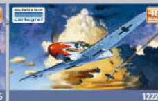
MESSERSCHMITT Bf109K-4 Reproduction of Bf109K-4 fuselage. Reproductions of machine gun barrel and Pist tube in metal.