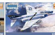
USN F-4J VF-84 "JOLLY ROGERS" Accurately reproduction of F-4J type served during Vietnam War by U.S. Navy. For your statements of air-to-air and air-to-ground combat. Reproductions of typical low and heavy tail of J-type.