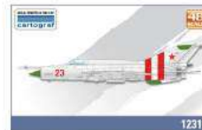
MIG-21 MF "SOVIET AIR FORCE & EXPORT" Supersonic fighter developed by Soviet Air Force. Accurately detailed panel lines & rivets. Precisely engraved cockpit & landing gear. No-armor surfaces and air-to-air weapons included. Includes full marking options.