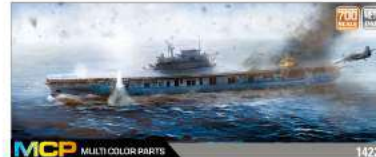
USS ENTERPRISE CV-6 14221