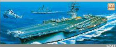
U.S.S. CVN-68 NIMITZ 14213