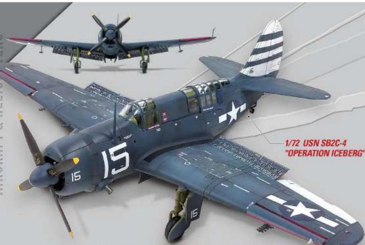
1/72 USN SB2C-4 "OPERATION ICEBERG"