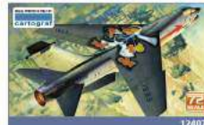
F-8P "FRENCH NAVY SPECIAL" Fully engraved panel lines & rivet details. Highly detailed cockpit interior & landing gear compartment. Open or closed airbrake.