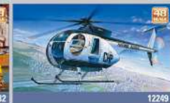
500D POLICE HELICOPTER This version of the 500D series helicopter was built for the police service. This kit includes a policeman figure and a motor cycle.