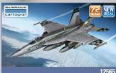
USN F/A-18E "VFA-195 CHIPPY HO" Single-seat, twin-engine, carrier capable, U.S. Navy, multirole fighter can be armed with air-to-air and air-to-ground weapons.