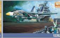
F-14A The U.S. Navy's premier carrier-based fighter, the F-14A Tomcat is capable of Mach 3 flight and low-speed engagements thanks to its variable-geometry wings.