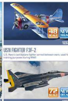
USN FIGHTER F3F-2 U.S. Navy's last biplane fighter served between wars; used for training purposes during WWII.