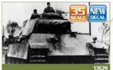
PZ.KPFW.V PANTHER AUSEG "VERLÄR" WW2 German medium tank with sloped armor and 7.5cm/75 main gun.