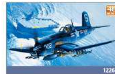
F4U-4B Many planes have borne the name but none have been as devastating to the enemy as the carrier-based World War II F4U-4B.