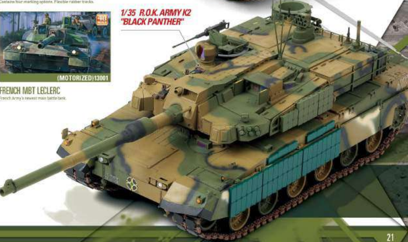
1/35 R.O.K. ARMY K2 "BLACK PANTHER"