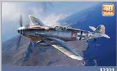
MESSERSCHMITT Bf109G-2 "JG 27" WWII German Luftwaffe's fighter. Includes 20mm MK108 cannon, propeller, landing gear & air filter for engine in landing position. Built as G-4 or G-2 variant. Carries eight marking systems.