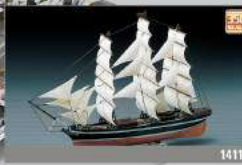
CUTTY SARK 14110