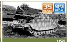
GERMAN PANZER IV "VERLÄTE" / "AUSE" / "VERLÄR" The most famous WW2 German tank, armed with 7.5cm/48 main gun.