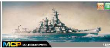
U.S.S. MISSOURI BB-63 14222