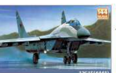
M-29 FULCRUM This superior air superiority and ground attack fighter, first flown in 1988 and shares many similarities with the American F/A-18 Hornet.