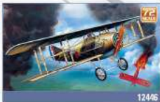
SPAD XIII WWI FIGHTER One of the fastest and most famous World War I fighters, the Spad flew for the Allied forces.