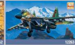
M-29A FULCRUM A This supersonic and superbly well-ground attack fighter, first flew in 1955 and shows many similarities with the American F/A-7B Hornet.