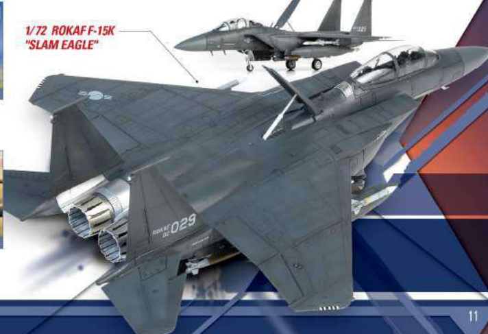
1/72 ROKAF F-15K "SLAM EAGLE"

Bomber and crew logged 27,800 combat miles and dropped more than 61 tons of bombs.