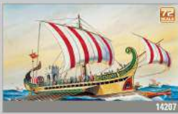
ROMAN WARSHIP CIRCA B.C. 50 14207