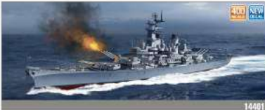
USS MISSOURI (BB-63) 14401