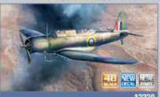
V-156-B1 "CHESAPEAKE" America's carrier-based dive bomber used by the Royal Navy's Fleet Air Arm for anti-submarine patrols early in WWII.