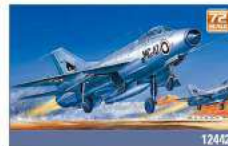
M-21 FISHBED The version of the Probetbed was widely used during the Vietnam and the Middle-East War.