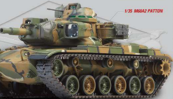
1/35 M60A2 PATTON