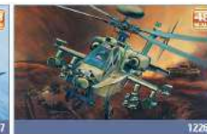
AH-64D LONGBOW The Longbow is a fully updated version of the AH-64 including the highly advanced Long-bow/Hellfire target acquisition system.