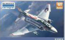
USN F-4J "VF-102 DIAMONDBACKS" A full complement of air-to-air and air-to-surface armaments. Precise reproduction of the F-4's target rack landing gear wheels. Highly detailed cockpit and landing gear. Accurately engraved, precision panel lines and rivets. Three pilot figures, one standing, two seated.