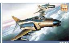
F-4F Considered as the leading all-round combat aircraft of the 1960s, the Phantom is capable of Mach 2-plus speeds.