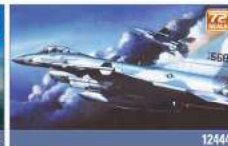
YF-16 The early prototype version of the supersonic F-16 fighter jet.