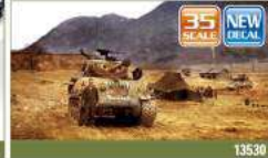
U.S. ARMY M4A3E8 "KOREAN WAR" U.S. Army medium tank with wide tracks and HVSS, deployed during the Korean War.