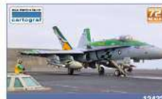
F/A-18C "CHIPPY HO!" 2009 Fully engraved panel lines & rivet details. Highly detailed cockpit interior & landing gear compartment.