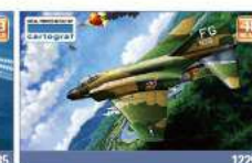
USAF F-4C "VIETNAM WAR" C-type used during Vietnam War by USAF. Various armaments of air-to-air and air-to-ground combat. Reproductions of typical side view and heavy tail of C-type. Includes three pilot figures included.