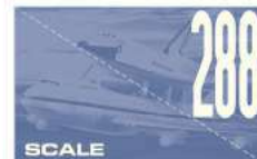
SHUTTLE & 747 CARRIER To transport the Space Shuttle to destinations around the U.S., the space agency modified a Boeing 747 to carry the Shuttle spacebay-style.