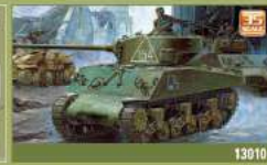
M4A2 SHERMAN "RUSSIAN ARMY" The diesel engine version of the famous U.S. Sherman tank, saw extensive action in the Pacific Theater and Russian front during World War II.