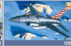
F-16A/C A single-seat fighter, this lightweight jet is one of the United States' best air-to-air combat fighters.