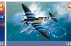
SPITFIRE MK. XIVc The World War II classic, the Spitfire was vital in ensuring the skies over London during the Battle of Britain.