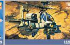
AH-64A This highly agile and well-armed U.S. Army attack helicopter first flew in 1976, saw extensive action in both Operation Just Cause in Panama and Operation Desert Storm in the Middle East.