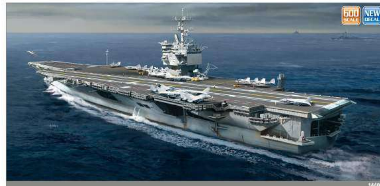
USS ENTERPRISE (CVN-65) 14400