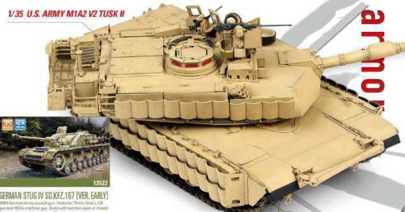
1/35 U.S. ARMY M1A2 V2 TUSK II