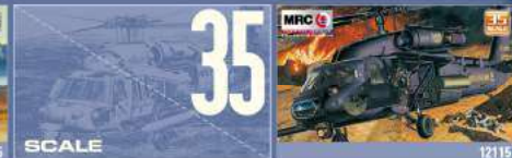
AH-60L DAP The Direct Action Penetrator (DAP) is one of the most awesome and/or awesome platforms operated by the US Army's Special Operations Forces.