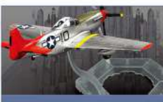
AERO DISPLAY STAND You can display up to the maximum three models and fix multiple stands by included connecting parts.