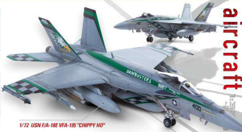
1/72 USN F/A-18E VFA-195 "CHIPPY HO"