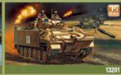
WARRIOR MCV "IRAQ 2003" British Army's main MCV used in Civil Wars in EU, Yugoslavia as well as Iraq War recently.