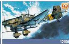
JU-87G STUKA "TANK BUSTER" This canvas-wing dive bomber, initially flown in 1936, and ground attack aircraft tested through World War II.