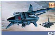
M-23S FLOGGER-B This variable-geometry combat plane was Russia's primary tactical air-to-air fighter during the Cold War.