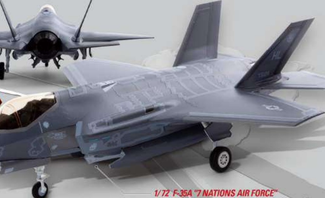
1/72 F-35A "7 NATIONS AIR FORCE"