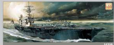
U.S.S. CVN-63 KITTY HAWK 14210