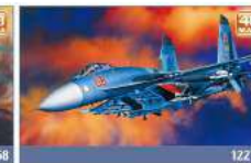
S-27 FLANKER B The S-27 was designed as a long-range interceptor to replace the outdated Mi-21.