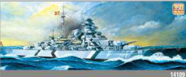
GERMAN BATTLESHIP BISMARCK 14109