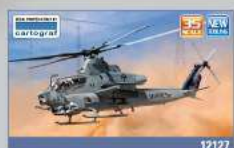
USMC AH-1Z "SHARK MOUTH" Newer upgrade series of AH-1Z attack helicopter used by USMC. Features 23mm rotary cannon, AGM-114 and AGM-119 Hellfires, as well as two types of rocket pods. Please consult parts. Work for variety included.