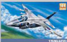
SEPECAT JAGUAR A lightweight support aircraft, this British and French jet can carry a vast array of weaponry, including the ANS2 tactical nuclear weapon.