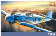
MESSERSCHMITT Bf109C-14 The Bf109, which first saw action in 1937 during the Spanish Civil War, went on to become one of the Luftwaffe's most important aircraft.