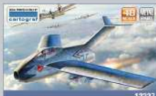
FOCKE-WULF TA183 HUCKERBEIN This WWII German jet fighter design was never fully developed. Masking seal for clear parts included. Contains photo-etched parts.