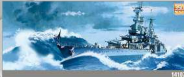
U.S.S. INDIANAPOLIS (CA-35) 14107