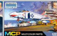
F-4B VF-111 "SUNDOWNERS" Precisely reproduced as a variety of Phantom Type B of U.S. Navy used during Vietnam War. Reproduction of panel markings, rotor area & the main wings. Perfect set for air wings and jet-to-ground weapons.