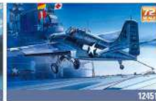
F4F-4 The F4F-4 began service with the U.S. Navy shortly before the Japanese bombed Pearl Harbor in December of 1941 and saw extensive action in the Pacific.