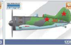
POLIKARPOV I-16 TYPE 24 Accurately detailed panel lines. Precisely engraved cockpit, instrument panel & landing gear. Various air-to-air surface rockets and machine guns. Includes four World War II Russian military marking options.