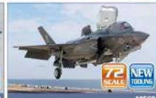
USMC F-35B The world's first supersonic STOVL stealth multirole aircraft operated by the current USMC.