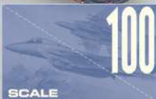
F-15 Designed specifically to be a superior fighter jet, this plane carries an astounding array of air-to-air and air-to-surface weapons.