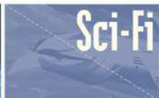
Sci-Fi Special Effect parts. Five G-vehicles (G1, G2, G3, G4, G5). Five Gatchesmen of various size figures. Display stand.