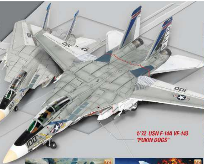
1/72 USN F-14A VF-143 "PUKIN DOGS"