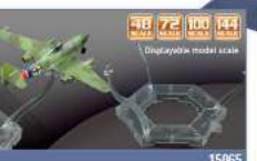
NEW GOD PHOENIX Special Effect parts. Five G-vehicles (G1, G2, G3, G4, G5). Five Gatchesmen of various size figures. Display stand.