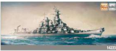
USS MISSOURI 14223