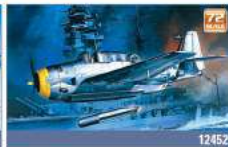
TBF-1 Designed as a torpedo bomber, the TBF-1 speed and performance made it a constant threat to enemy ships during World War II.