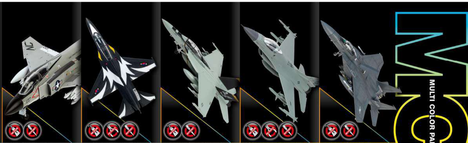
▶ 1/72 USN F-4J "SHOWTIME 100" ▶ 1/72 ROKAF T-50B "BLACK EAGLES" ▶ 1/72 USN A/F-18F "VFA-103 JOLLY ROGERS" ▶ 1/72 USAF F-16C "MULTIROLE FIGHTER" ▶ 1/72 ROKAF F-15K "SLAM EAGLE"

This is a multicolored kit, which can be a precise reproduction of reality not having to paint.