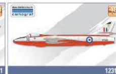
RAF EXPORT HAWKER HUNTER E6/FGA.9 Subsonic Jet Aircraft developed by United Kingdom. Can be built as F4 or FGA.9. Accurately detailed panel lines & rivets. Precisely engraved cockpit & landing gear. Includes air markings options.