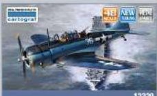
USMC SBD-5 "BATTLE OF THE PHILIPPINE SEA" WWII US Navy dive bomber. Assemble with dive flap closed or landing or full opened. Masking seal for clear parts included. Photo-etched parts included.