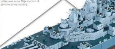
1/400 USS MISSOURI (BB-63) 15122