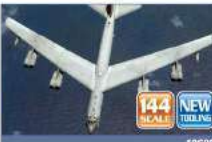
USAF B-52 Modern U.S. Air Force's long-range strategic bomber.