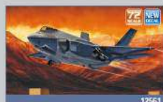
F-35A "7 NATIONS AIR FORCE" Latest stealth, multirole fighter designed by USAir Force.