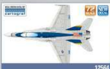
USN F/A-18C "VFA-192 GOLDEN DRAGONS" Automatically detailed panel lines & rivets. Assembly with canopy open or closed. Versatile air-to-air and air-to-ground weapons included. Precisely engraved cockpit & landing gear.