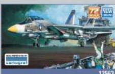
USN F-14A VF-143 "PUKIN DOGS" Superior, twin-engine, variable-sweep wing fighter used by the U.S. Navy as an superiority fighter, fuel defense interceptor and as tactical aerial reconnaissance missions.