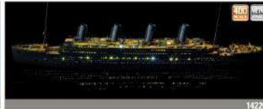
R.M.S. TITANIC PREMIUM EDITION with LED 14226