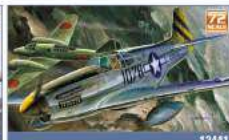
P-51C WWII used by the American and British forces, the Mustang was clearly suited for tactical reconnaissance and its standard four U.S. Tech machine guns meant that it also had potential for ground attack.