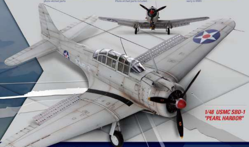
1/48 USMC SBD-1 "PEARL HARBOR"