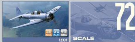
USMC SBD-1 "PEARL HARBOR" Carrier-based dive bomber used by the U.S. Navy during early stages of WWII.