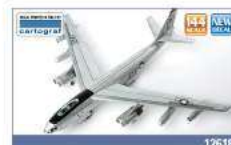
USAF B-47 "306TH BW(M)" Cold War era, U.S. Air Force nuclear bomber. Can be built as B-47 or B-47. Accurately detailed panel lines.