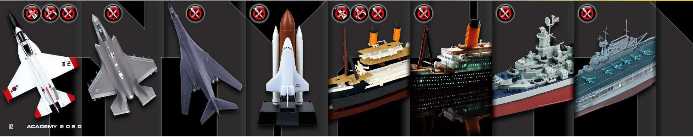
▶ 1/72 ROKAF T-50 ADVANCED TRAINER ▶ 1/72 USAF F-35A ▶ 1/144 USAF B-1B 34TH BS "THUNDERBIRDS" ▶ 1/288 SPACE SHUTTLE & BOOSTER ROCKETS ▶ 1/1000 R.M.S. TITANIC ▶ 1/700 R.M.S. TITANIC + LED SET ▶ 1/700 USS MISSOURI BB-63 ▶ 1/700 USS ENTERPRISE CV-6