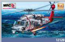
MH-60S HSC-9 "TRIDENTS" Extensive cockpit detailing. Detailed jet engine and rotor assembly. MCP's 19-inch Rocket Launcher & AGM-114 Hellfire included. New parts for U.S. Navy included.