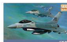
F-16 This lightweight single-seat fighter jet is one of the United States' best air-to-air combat fighters.