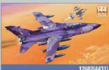
PANAVIA TORNADO Known as an MRCA (multi-role combat aircraft), the Tornado is the result of a collaboration between Germany, Italy and Britain for use as their primary interceptor.